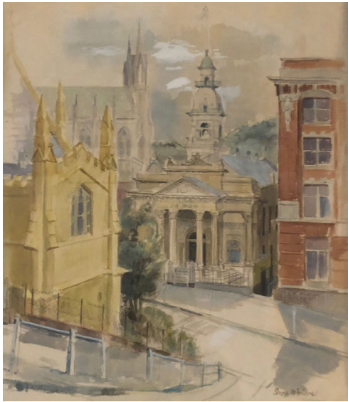
Shona McFarlane's painting of the view down View Street.

At least twenty times a day for the past 16 years I have passed the Shona McFarlane water colour (pictured below) which hangs in the school corridor of the main Dalrymple block.